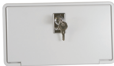
97023-A-5 Locking Shower