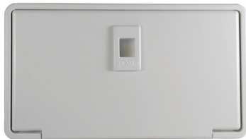
97022-A-5 Latching Shower